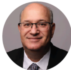
Ilan Goldfajn IDB President