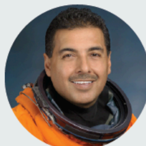
José M. Hernández , Featured Speaker

Mexican-American NASA engineer and former astronaut. His life story inspired the film A Million Miles Away , recently released on Amazon Prime Video.